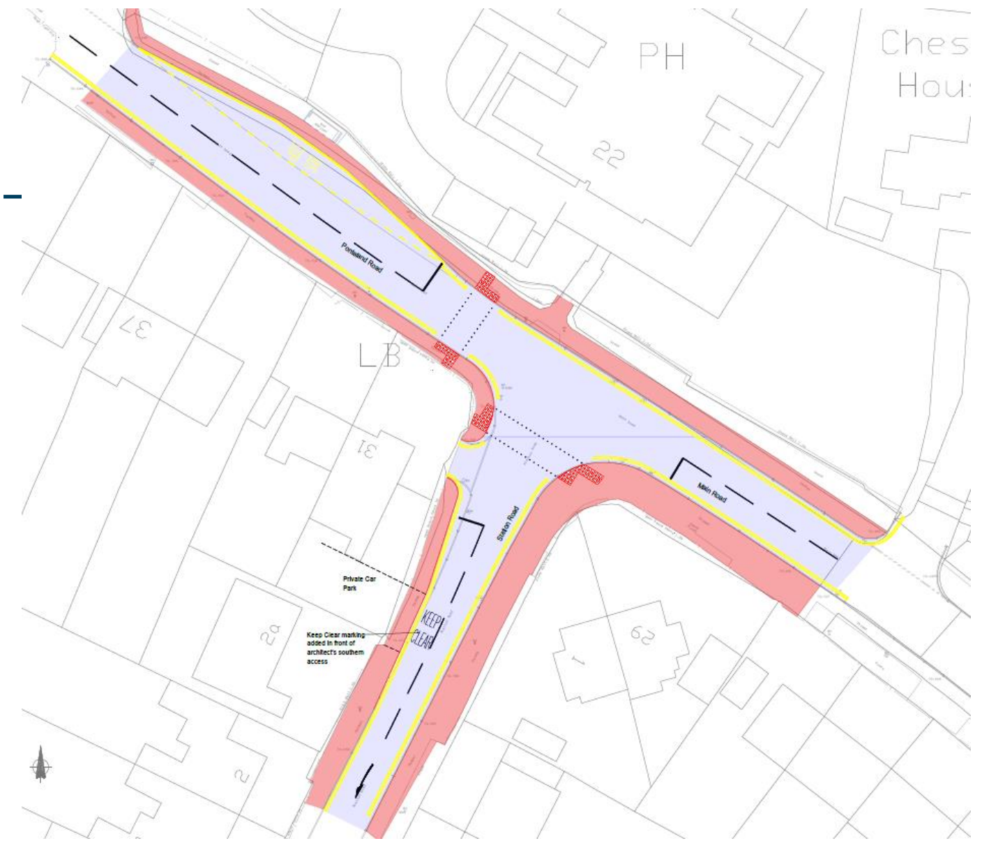
Plan showing junction improvement works at Main Road and Station Road, Kenton Bankfoot