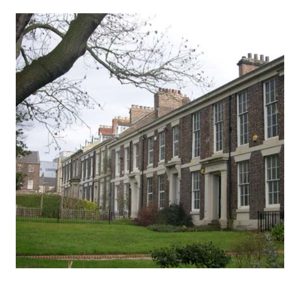
Date of Designation 1970