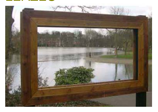
Date of Designation 03 September 1974