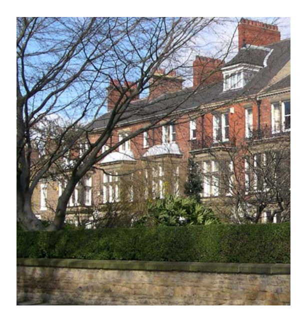
Date of Designation 04 October 1976